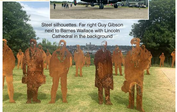
Steel silhouettes. Far right Guy Gibson next to Barnes Wallace with Lincoln Cathedral in the background

Some of you may recall Churchill's comment, "that although the Germans built a fortress around mainland Europe, they forgot to put a roof on it". But for the bravery and sacrifice of those Airman undertaking endless missions and their wholehearted support teams, life would have been invariably different for Britain. I'm keen to go again for a second look and will read the IBCC book "Our Story - Your History" beforehand.