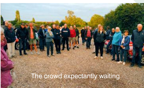
The crowd expectantly waiting

AMGC Event Details are on pages 13 to 15 of this Month's Newsletter. Make sure you don't miss out - Book Today