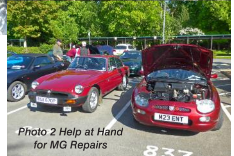
Photo 2 Help at Hand for MG Repairs

blocked windscreen washer jet water tube. Mind you it did require 2 lots of bonnets open (photo 2) and plenty of helping hands, as always 'The Marque of Friendship' was to the fore.