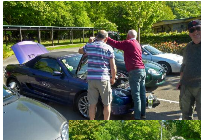
Photo 1 The Only MG Needing Repair