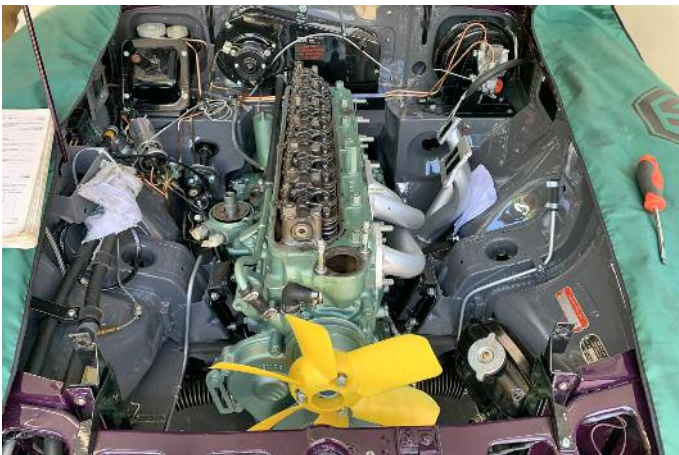
Engine back in place for the second time – getting quite good at this!

This time my son was not available to help me refit the engine and I was pushed to find someone to help. Luckily my neighbour came to the rescue. He has vast experience with Austin 7s, 12s and 16s so is well used to manoeuvring large chunks of iron. His help was invaluable