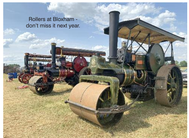
Rollers at Bloxham - don't miss it next year.