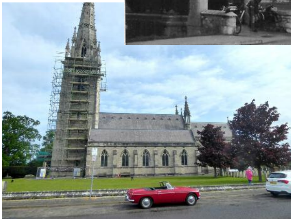
Bodelwydden Church Today