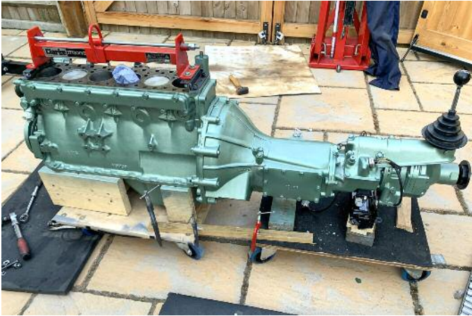
Engine again re-mated with the gearbox with touching up all of the paintwork

New main bearing shells and gasket set were put on order and duly arrived followed by a meticulous re-assembly of the engine bottom end. At each step checks were made to ensure that the crank turned over smoothly