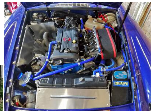
MGB Duratec Engine bay