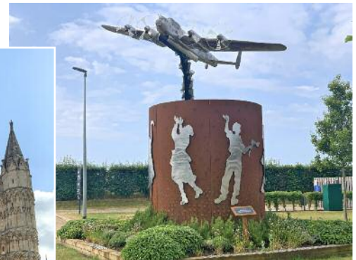
Top: Farm workers wishing our Boys well. Left: Lincoln Cathedral a magnificent structure, part of which is c900 years old