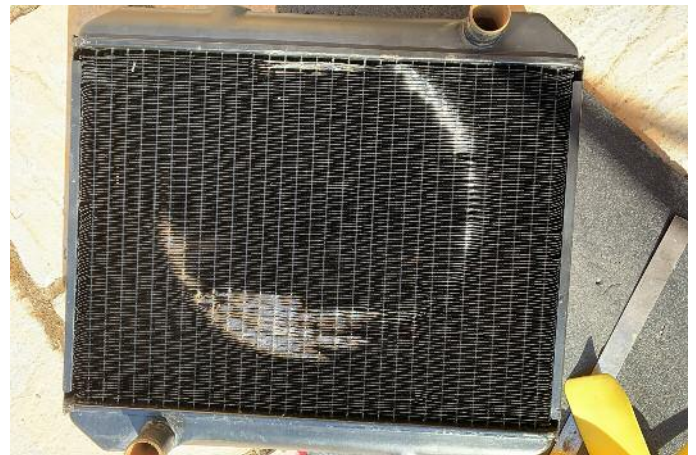
Cooling fan leaving its mark

After thorough checks had been made around the suspension nothing untoward was found. I then started the engine and could hear an occasional ticking noise. My heart sank. Could this be something within the engine, again? Several anxious minutes later I finally discovered that the fan blade was fouling the radiator and had created quite an impression in the cooling fins.