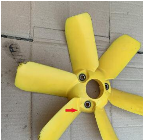
Stress lines in the fan

So, the hunt is on for a replacement fan blade. One was being advertised on E-bay in Sutton Coldfield. That's within striking distance and I can get it picked up the next day. The following day I was able to collect the fan but it turns out to be an aftermarket job again! Do I risk it with another repro part? I didn't get back home until early evening and felt that it was too much of a gamble to fit the part and then drive down to Beaulieu the next morning without further road testing so a decision was made to use the roadster instead. I was also able to borrow an original fan from a friend who went to the event so that should tide me over until I can obtain an original part. Fortunately the damage to the radiator was limited to the cooling fins and had not affected the core so a couple of hours were taken to straighten them all out and apply a few coats of paint.