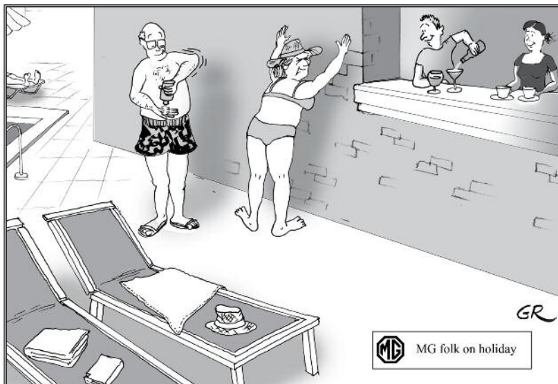
Right-ho, Mr Slap-it-On . . . do yer worst . . . I'm BRACED