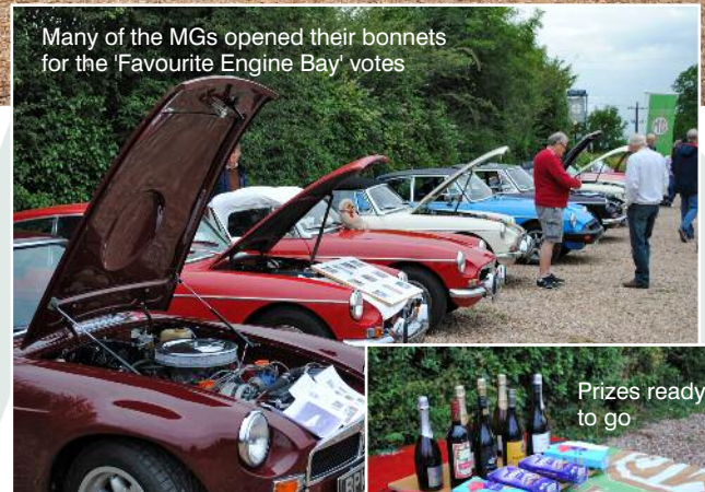
Many of the MGs opened their bonnets for the 'Favourite Engine Bay' votes