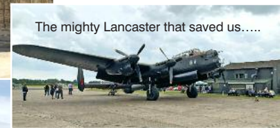
The mighty Lancaster that saved us.....

from Sparkhill. They were regularly featured in the magazine "Car and Car Conversions" which, back in the day and amongst "other" magazines, was a must read for every 14 year old lad.