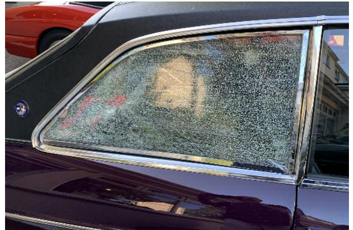
A roll of Sellotape can work wonders

The sweet moment was winning 1st in show at the 2023 Jersey Weekender event.