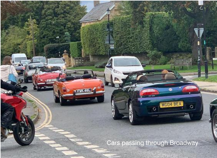
Cars passing through Broadway