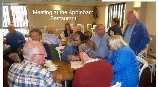
Meeting at the Applebarn Restaurant