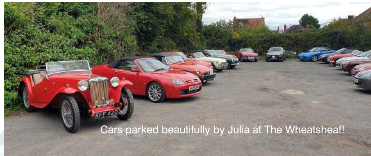
Cars parked beautifully by Julia at The Wheatsheaf!

All in All a great day which we hope everyone enjoyed.