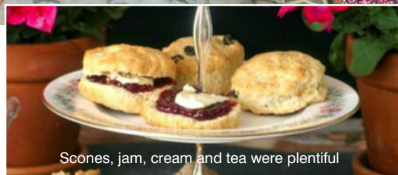
Scones, jam, cream and tea were plentiful