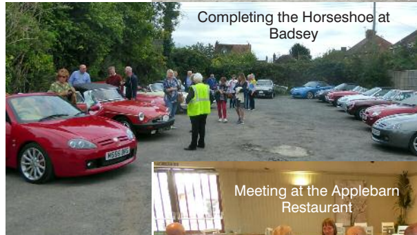
Completing the Horseshoe at Badsey