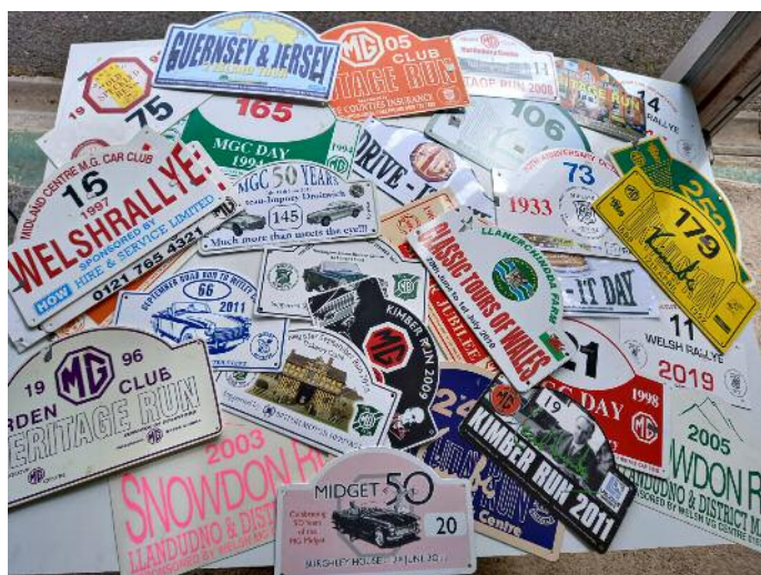
These are just some of the plaques, the others are on the walls!

Following on from the last notes, after the static events, I started doing road runs, some of the initial ones were the Kimber Run, Arden Run and Speckled Hen Run, MG Car Club - MGB Register Run, Midget Register Run, Midland Centre Welsh Rallye. But static events also changed with MGA Day, MGC Day, MGF Day, MGB 50, Midget 50 ..... These events had Rally Plaques that you attached to your car and also to your garage wall afterwards.