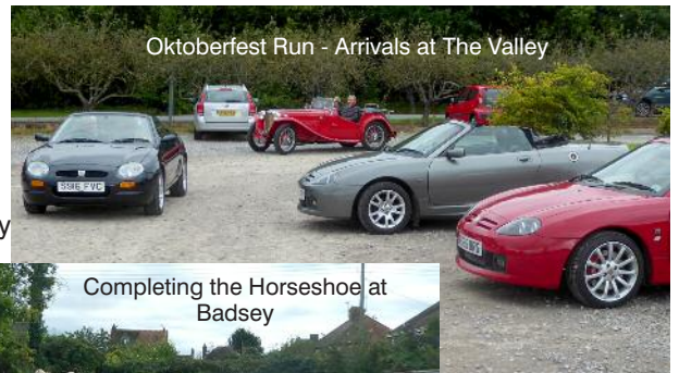
Oktoberfest Run - Arrivals at The Valley