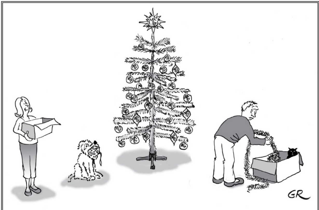
Be brave, Jeremy . . . it's time they all went back in the box.