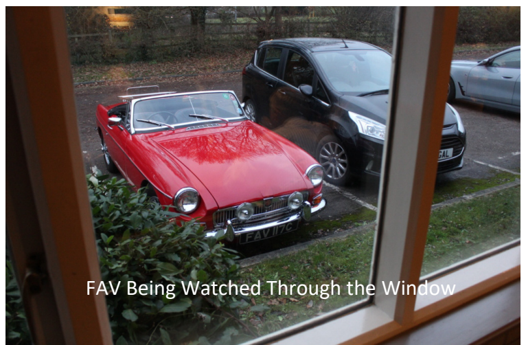
FAV Being Watched Through the Window

Thanks to all who took part, I think we did him proud.