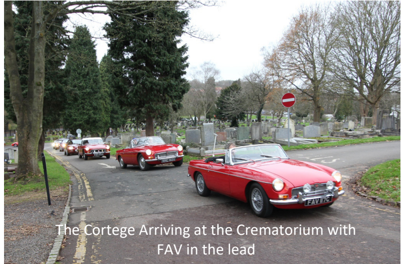
The Cortège Arriving at the Crematorium with FAV in the lead