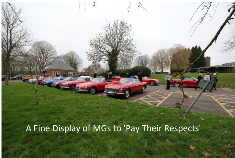
A Fine Display of MGs to 'Pay Their Respects'