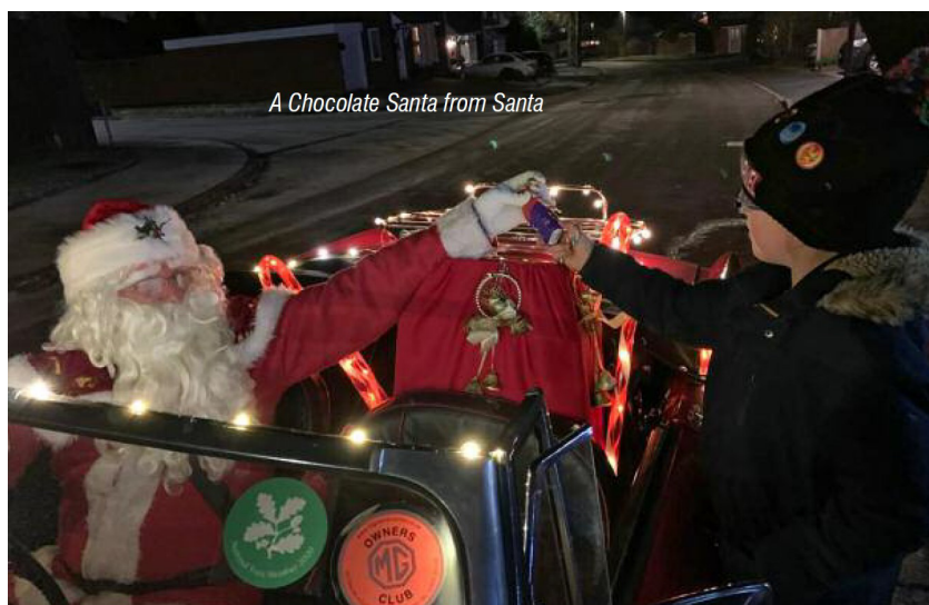
A Chocolate Santa from Santa