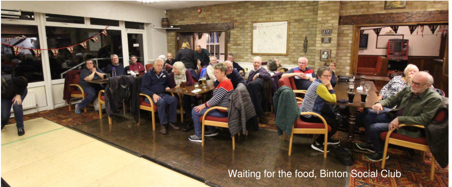
Waiting for the food, Binton Social Club