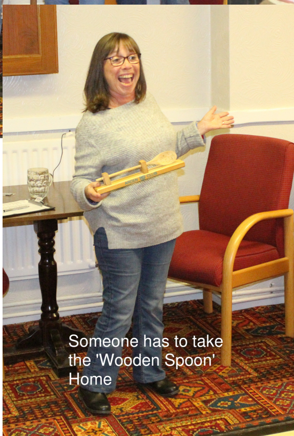
Someone has to take the 'Wooden Spoon' Home