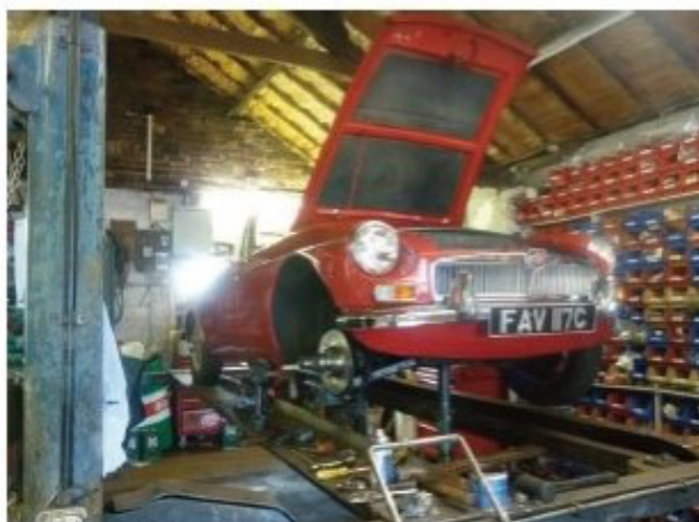
FAV in garage prior to purchase

Since purchase I have just about found time to re-pad the seats, re-rubber the quarterlights, fit new wheels and tyres, fit new rear springs, fit new SS exhaust and fix/improve many other bits and bobs not least the new spot lights. All done in keeping with the original specification where possible.