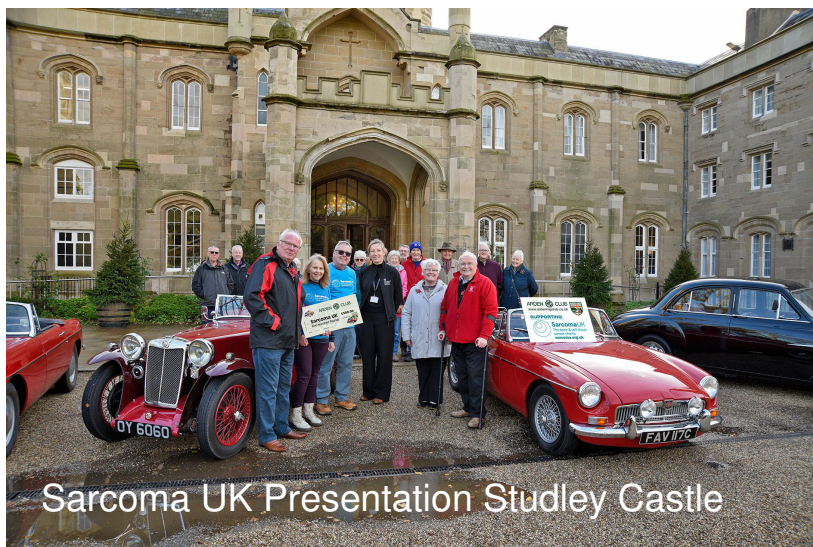
Sarcoma UK Presentation Studley Castle