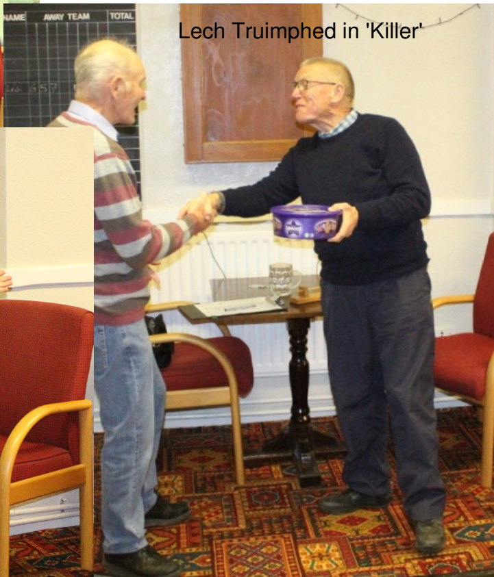
Lech Triumphed in 'Killer'