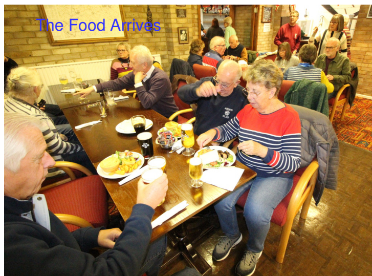
The Food Arrives

the usual format of Boys vs Girls. Play progressed well and we managed to squeeze in 3 rounds before the meal was served and everyone sat down to enjoy their basket meals, not to mention the plate fulls of bread & butter