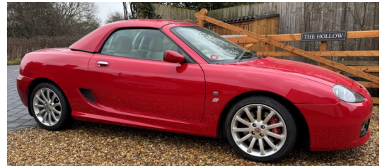
Jeff with his winter hat on

When we bought Jeff in April 2016, he had covered just 3,700 miles and was owned by gentleman in Kent, but for family reasons not used. It was garaged next to his Ferrari 430!