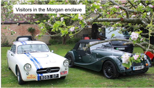
Visitors in the Morgan enclave

There were a lot of Morgans there as well, plus Morris dancers and lady Morris dancers.