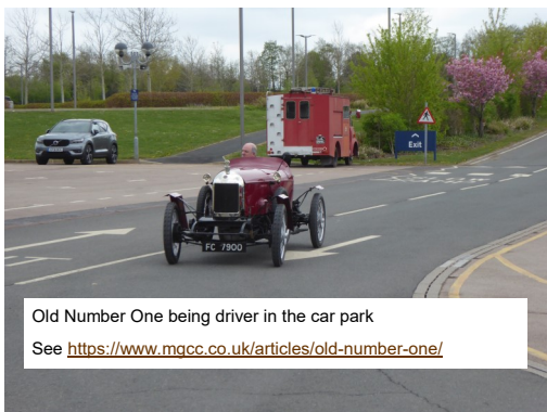
Old Number One being driver in the car park See https://www.mgcc.co.uk/articles/old-number-one/