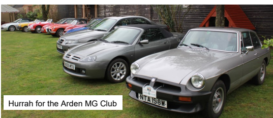
Hurrah for the Arden MG Club

A bit bleak and cold so we forced nourishing (free) bacon-and-asparagus baps between our unwilling lips. There was also an apparently traditional run involving sending 100 rounds of asparagus in cars in a motor cavalcade to Honeybourne station on their way to the Japanese Embassy in London. The call went out for cars to help and the Morgan people seemed to fill all the gaps almost instantly.