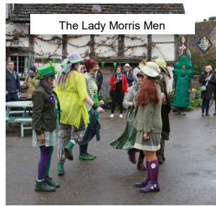
The Lady Morris Men