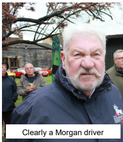
Clearly a Morgan driver