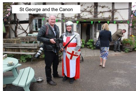
St George and the Canon

But it was also St George's Day . . . Hurrah!