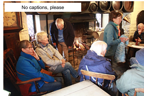
No captions, please

Back we came and then set off on the gaffer-of-the-pub's Post Code Treasure Hunt. Not sure how much we enjoyed it – but it certainly gave us an appreciation of the quality of our home-spun ones.