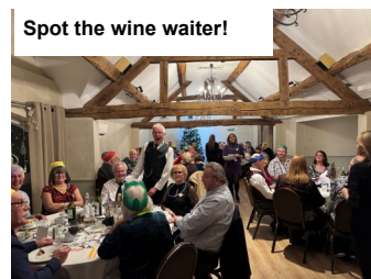
Spot the wine waiter!